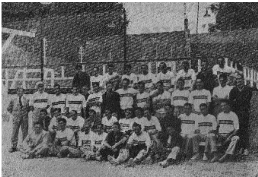
Imagen del equipo español que compitió en Barcelona en la edición de 1955.